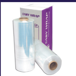
Machine Pallet Wrap