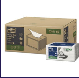
Wipes & Cloths