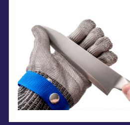
Chain Mail Protection