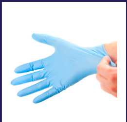
Metal Detectable Nitrile Gloves