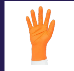
Diamond Textured Nitrile Gloves