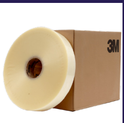
Machine Packaging Tape