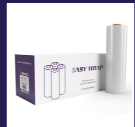
Hand Pallet Wrap