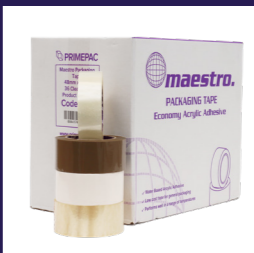
Hand Packaging Tape