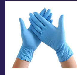
Long Cuff Nitrile Gloves