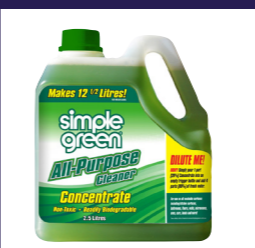
All Purpose Cleaners