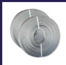
Premium Machine Strap