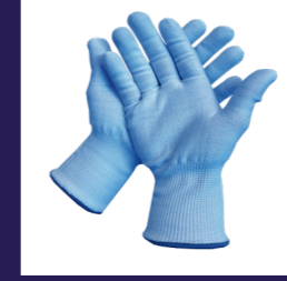
Cut Resistant Gloves